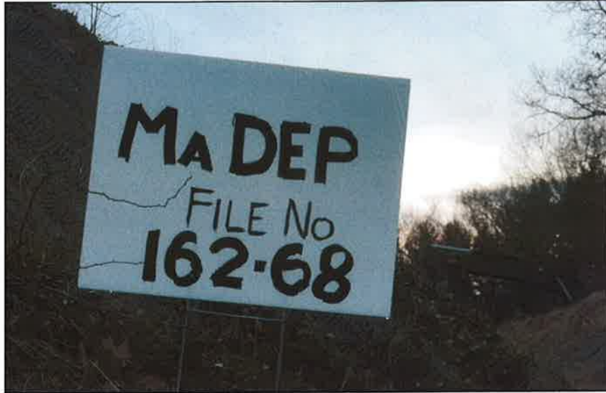
Phase III Bank Restoration for the Connecticut River in the Town of Gill, Massachusetts Bathory/Gallagher & Wallace/Watson Conservation Land