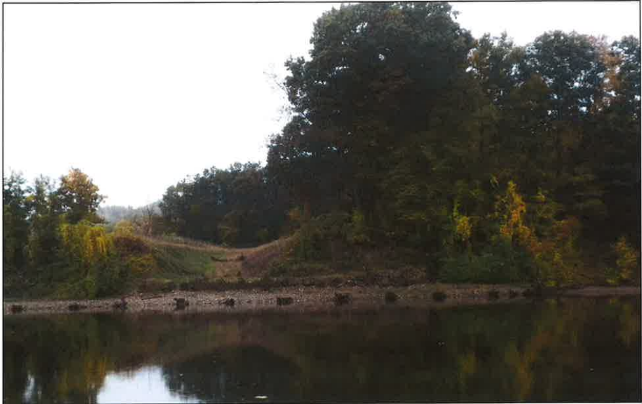
Construction access road as seen during October 5, 2012 Relicensing Site Tour.