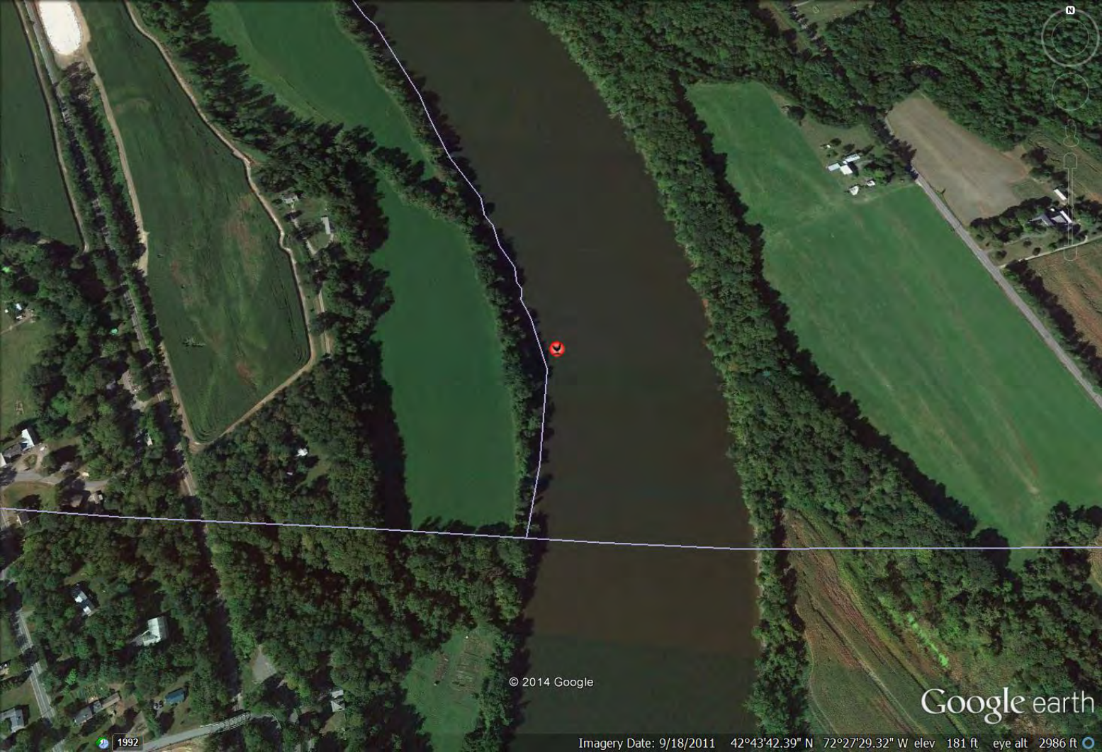
Photo 1223 Location

QA Observations: Upon review of the photos for this segment, classification made in the field was confirmed and additional indicators of potential future erosion were included.