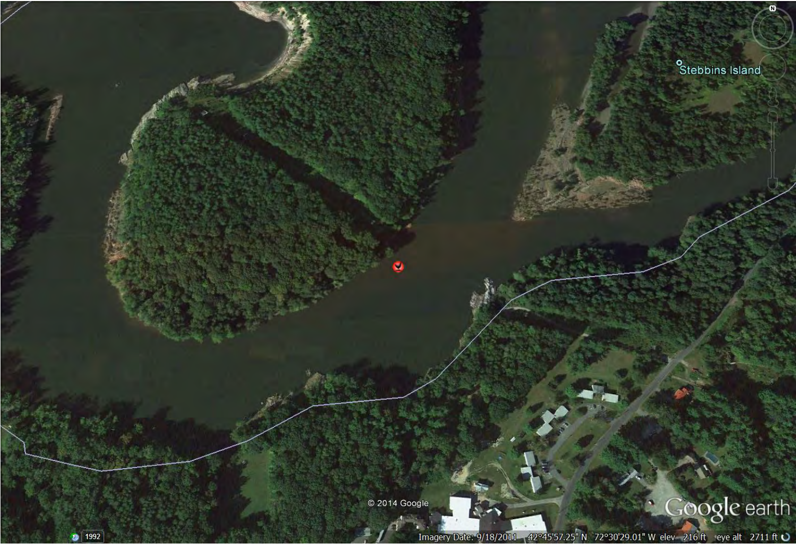
Photo 1425 Location

QA Observations: Upon review of the photos for this segment, classification made in the field was confirmed and additional indicators of potential future erosion were included. Segment added to include clay.