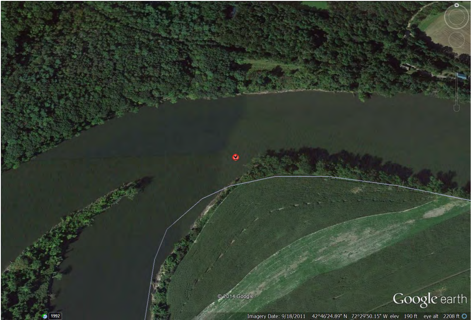
Photo 1339 Location

QA Observations: Upon review of the photos for this segment, classification made in the field was confirmed.