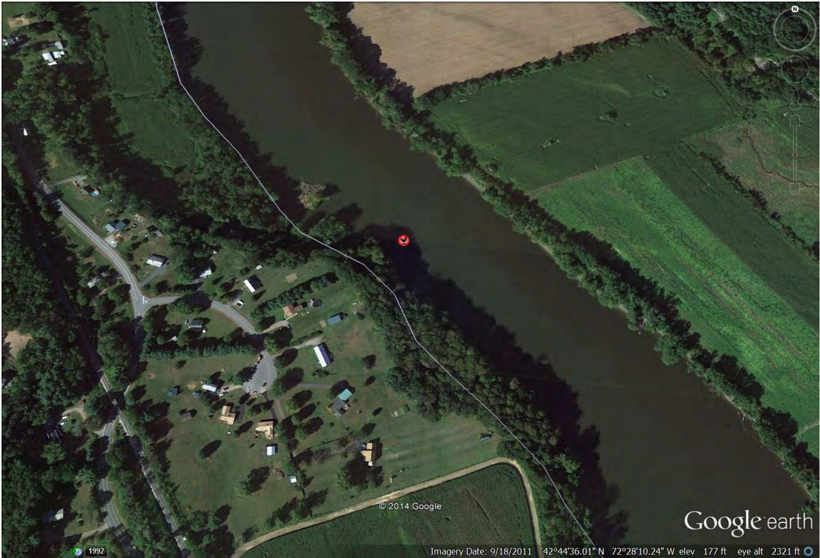
Photo 1257 Location

QA Observations: Upon review of the photos for this segment, classification made in the field was confirmed.