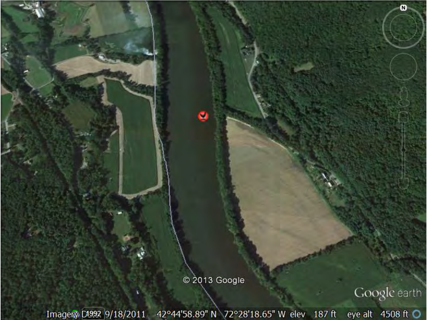
Photo 1631 Location

QA Observations: Upon review of the photos for this segment, classification made in the field was confirmed and additional indicators of potential future erosion were included. Segment added to include sparse lower riverbank vegetation.