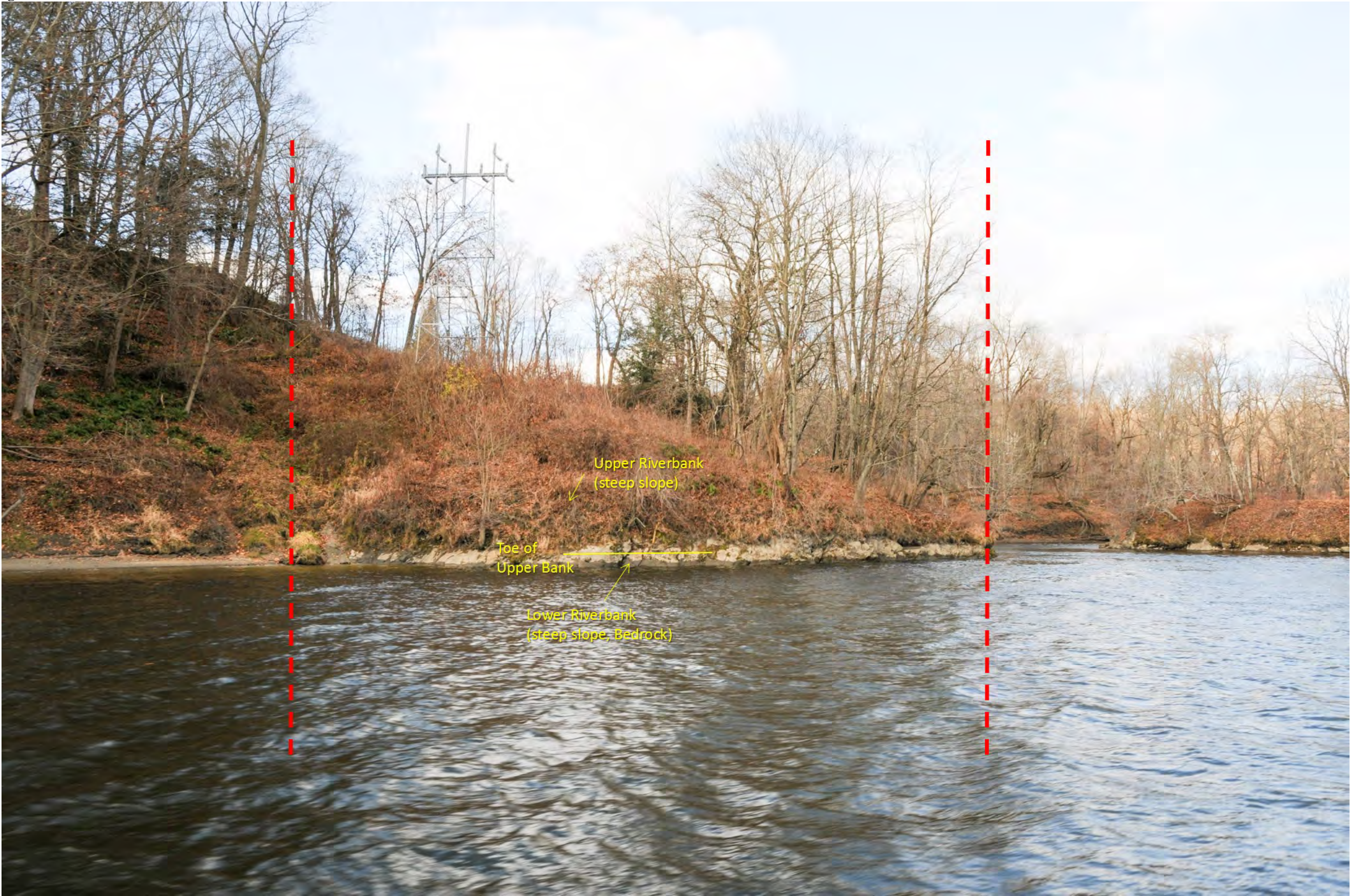
Photo ID 1257 (labeled portion of photo shows left, D/S portion of segment. Dashed lines represent approximate ends of segment)