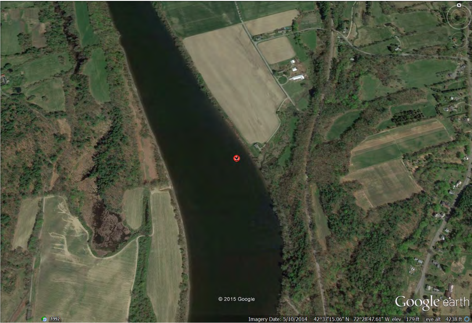
Photo 609 Location

QA Observations: Upon review of the photos for this segment, classification made in the field was confirmed. Segment added as a site of interest due to planned repair to existing restoration to deal with undercut and exposed roots.