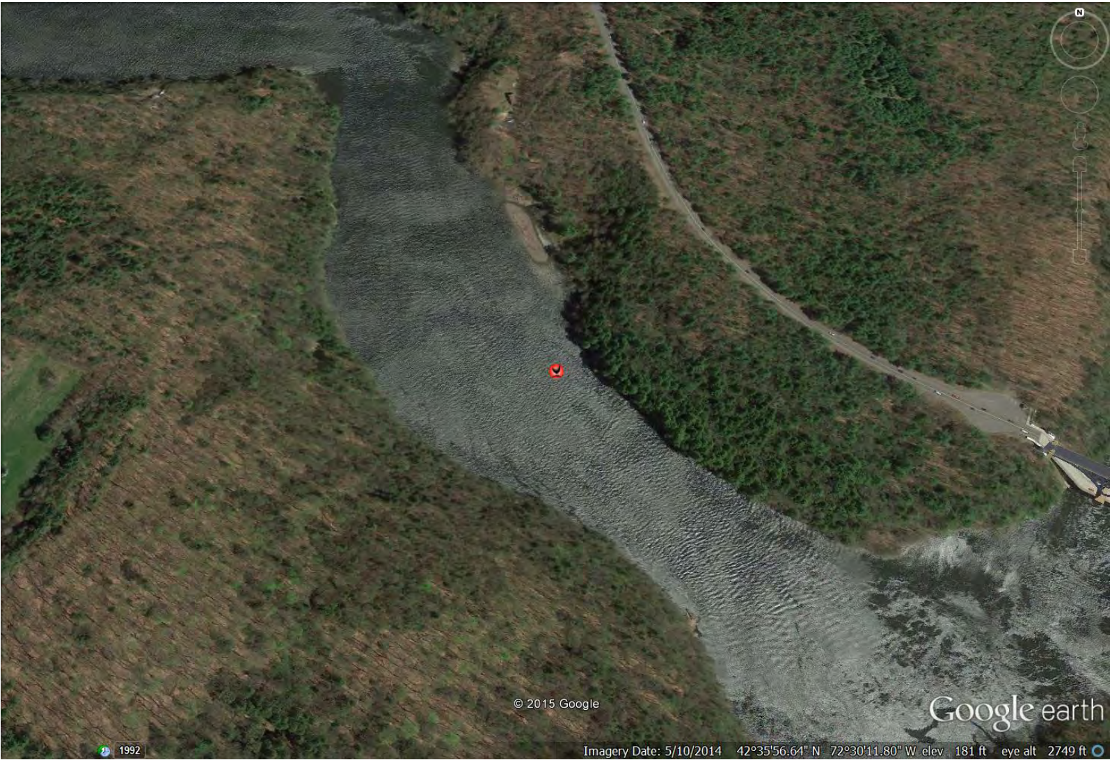
Photo 480 Location

QA Observations: Upon review of the photos for this segment, classification made in the field was confirmed. Segment added to include vertical lower riverbank.