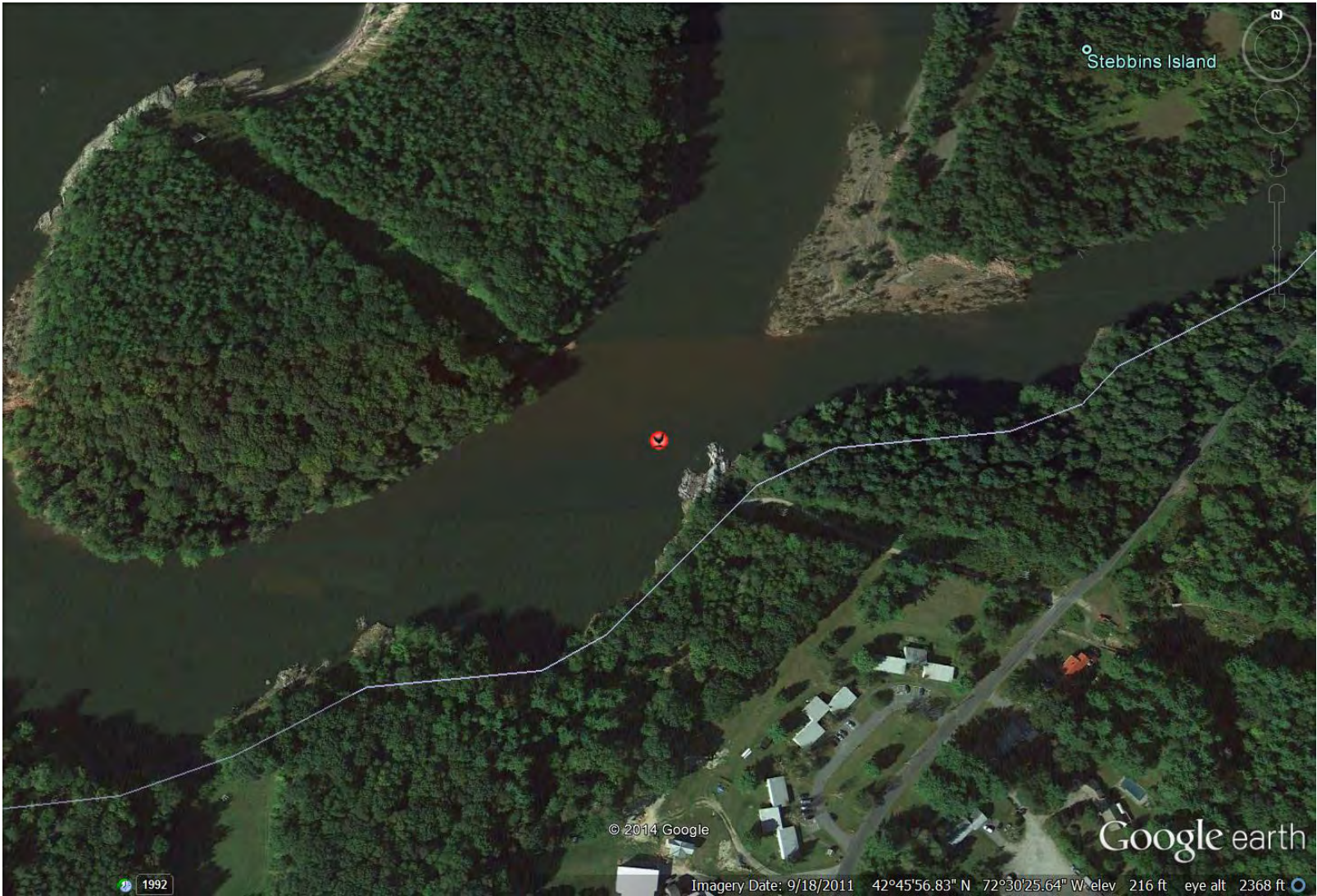
Photo 1370 Location

QA Observations: Upon review of the photos for this segment, classification made in the field was confirmed.