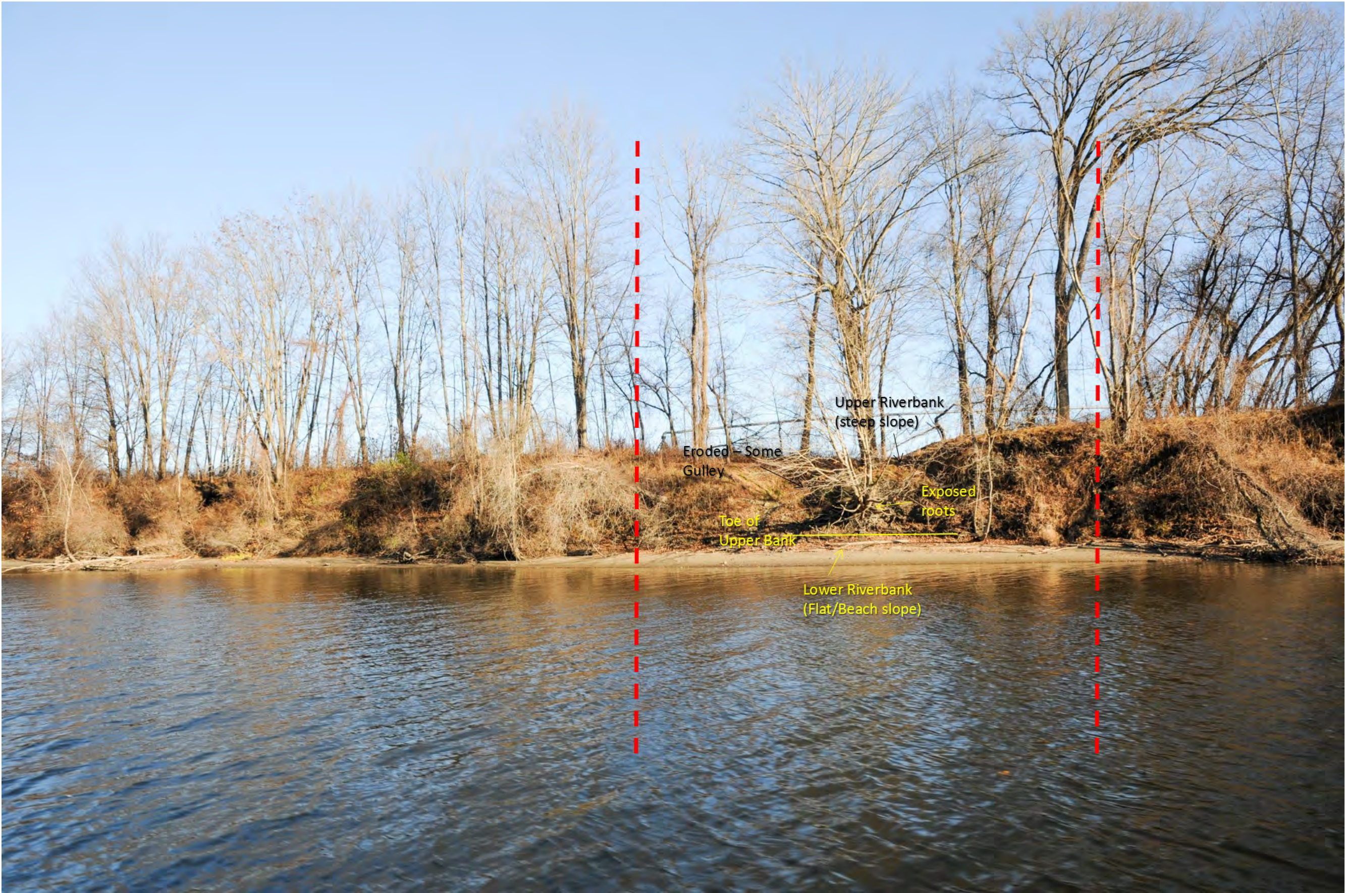
Photo ID 845 (segment is labeled portion of photo. Dashed line represents approximate end of segment)