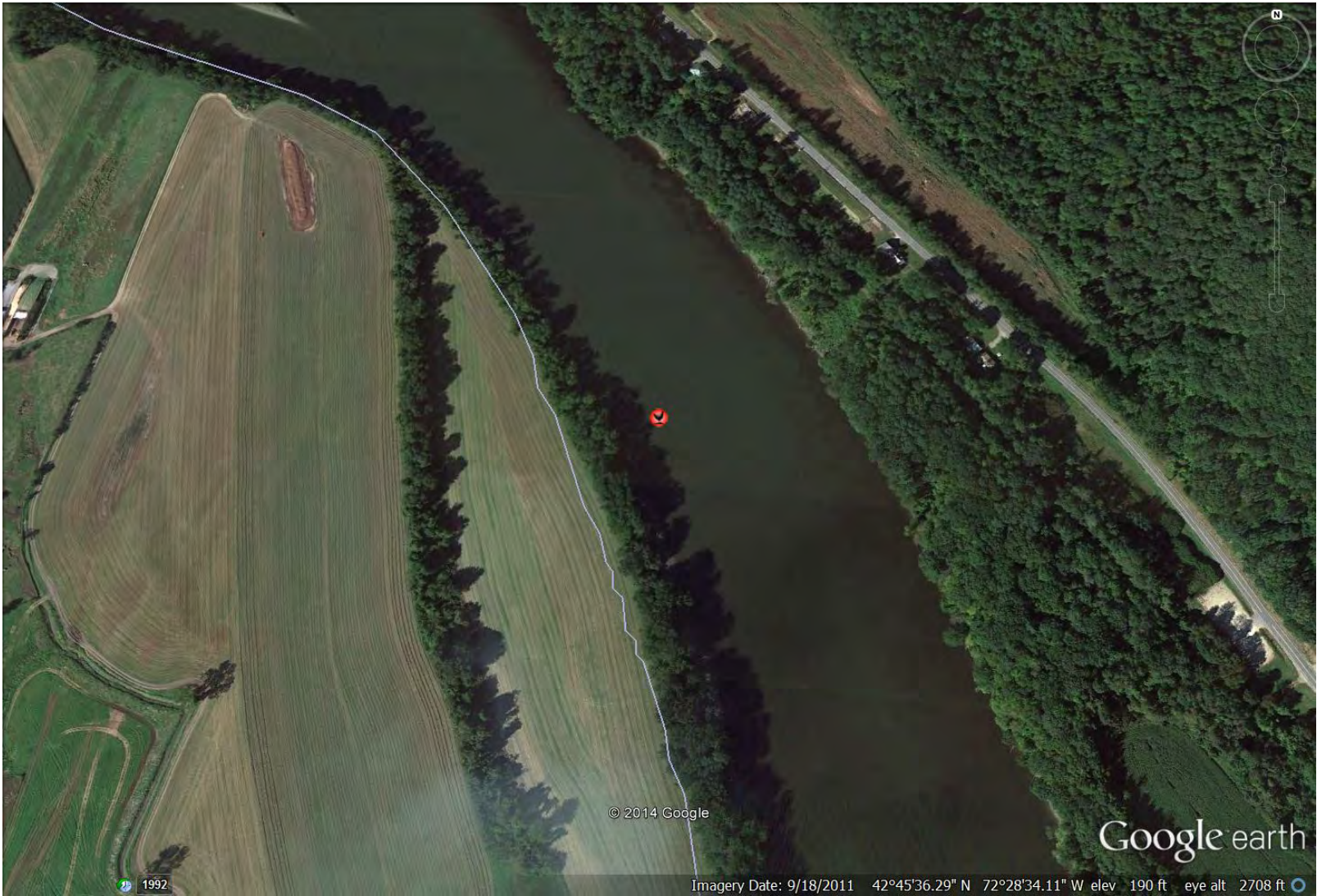
Photo 1298 Location

QA Observations: Upon review of the photos for this segment, classification made in the field was confirmed and additional indicators of potential future erosion were included.