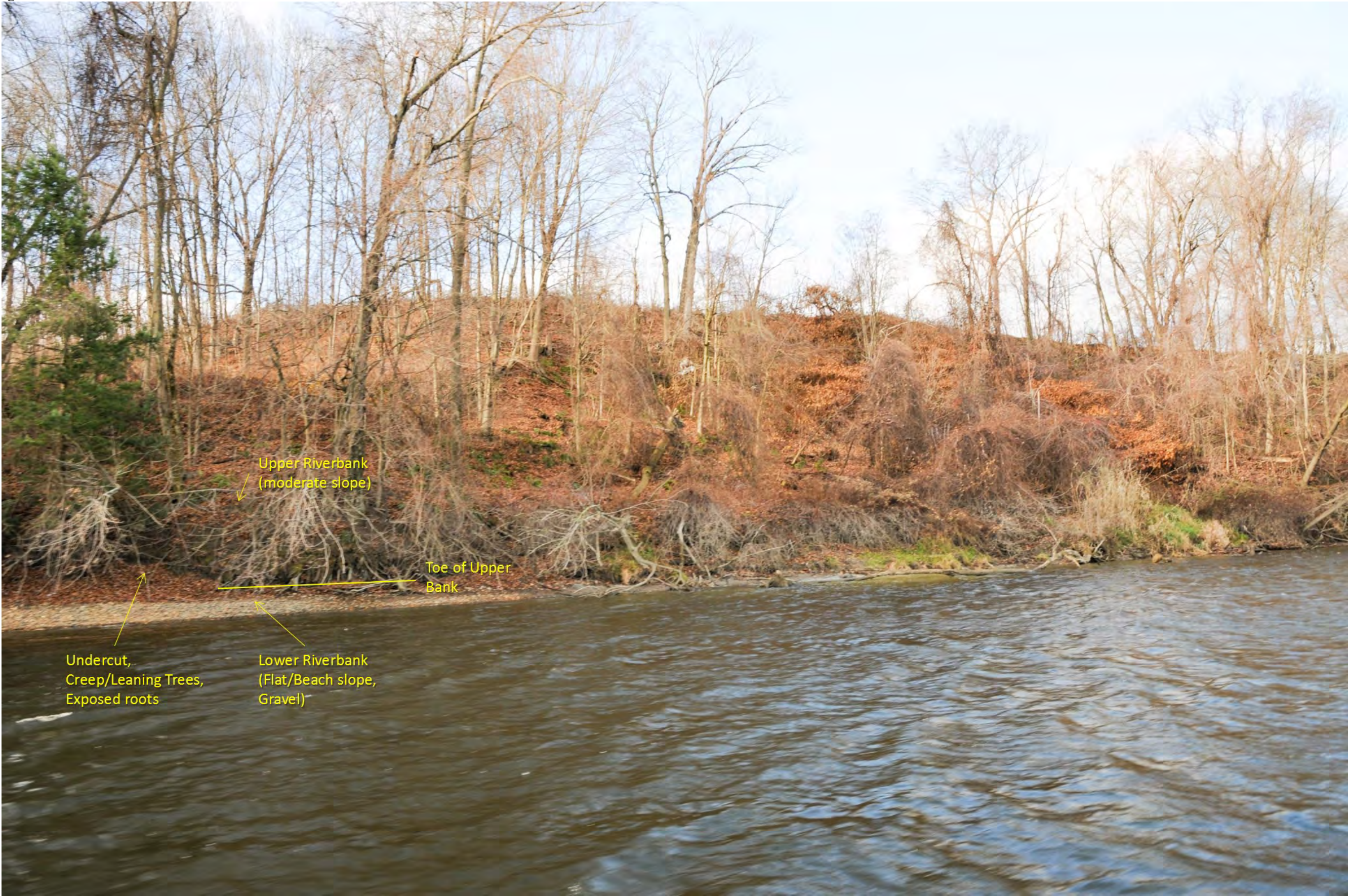
Photo ID 1241 (right, U/S portion of segment with labels) 2013 Full River Reconnaissance – 2015 Addendum Attachment A - DRAFT