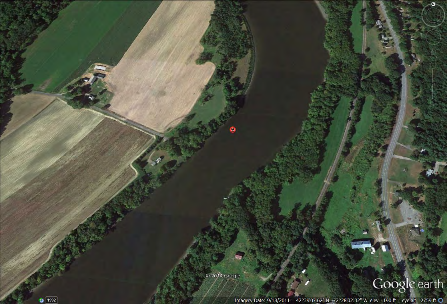
Photo 1036 Location

QA Observations: Upon review of the photos for this segment, classification made in the field was confirmed and additional indicators of potential future erosion were included.