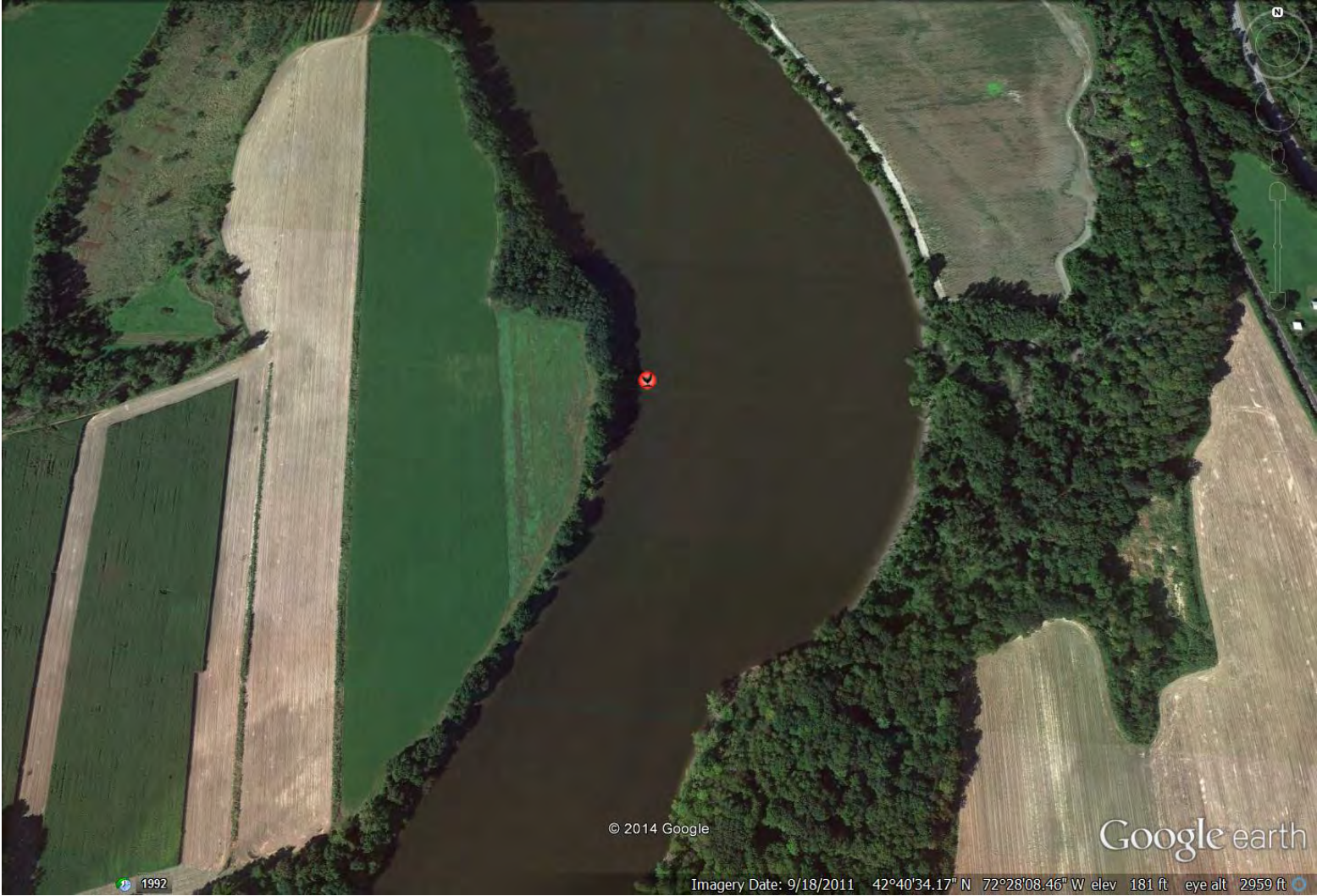
Photo 1093 Location

QA Observations: Upon review of the photos for this segment, classification made in the field was confirmed and additional indicators of potential future erosion were included.