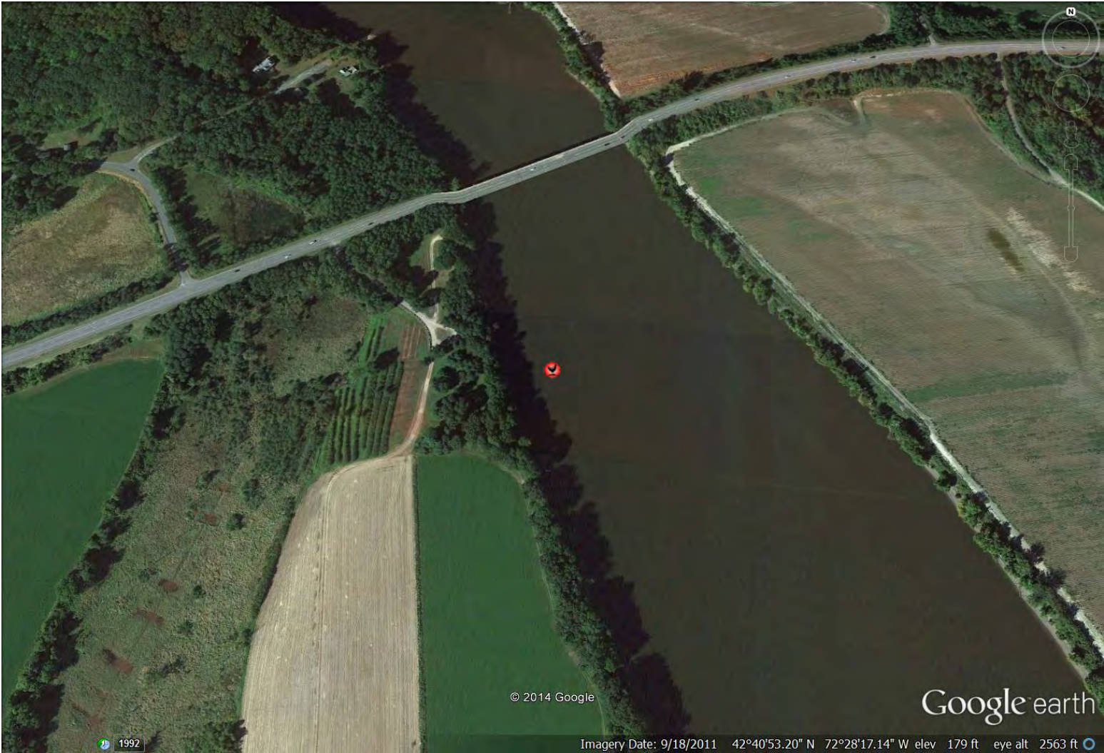
Photo 1104 Location

QA Observations: Upon review of the photos for this segment, classification made in the field was confirmed and additional indicators of potential future erosion were included.