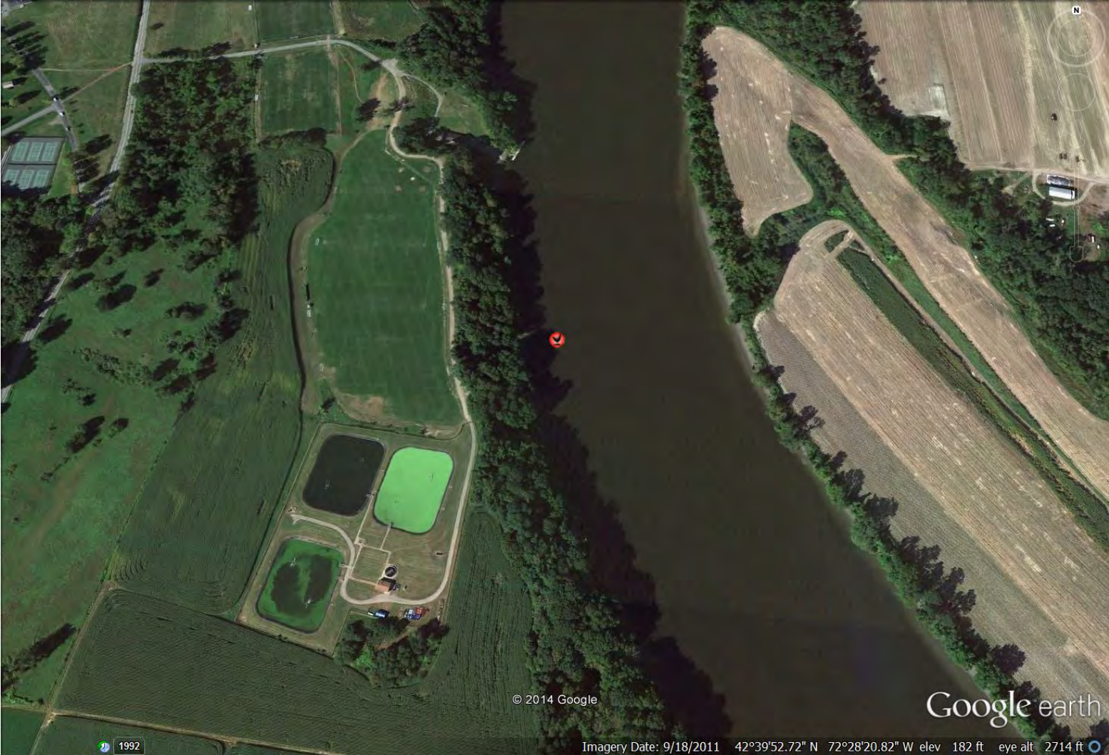
Photo 1066 Location

QA Observations: Upon review of the photos for this segment, classification made in the field was confirmed and additional indicators of potential future erosion were included.