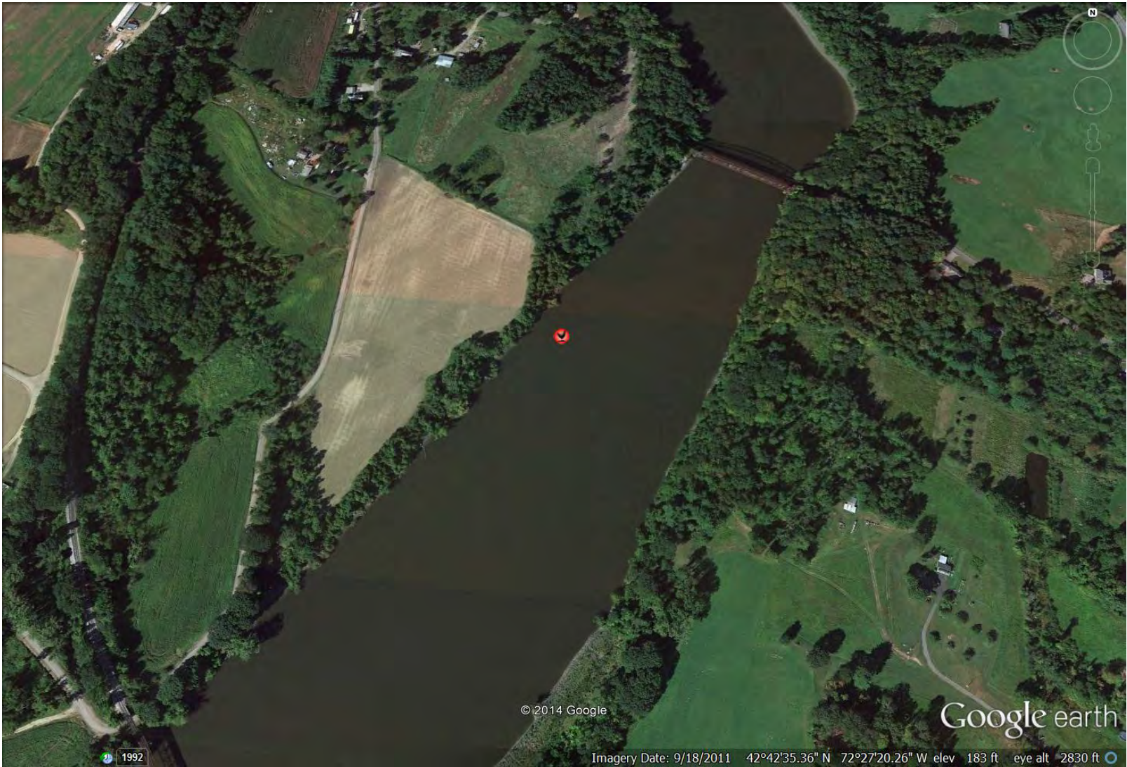
Photo 1183 Location

QA Observations: Upon review of the photos for this segment, classification made in the field was confirmed.