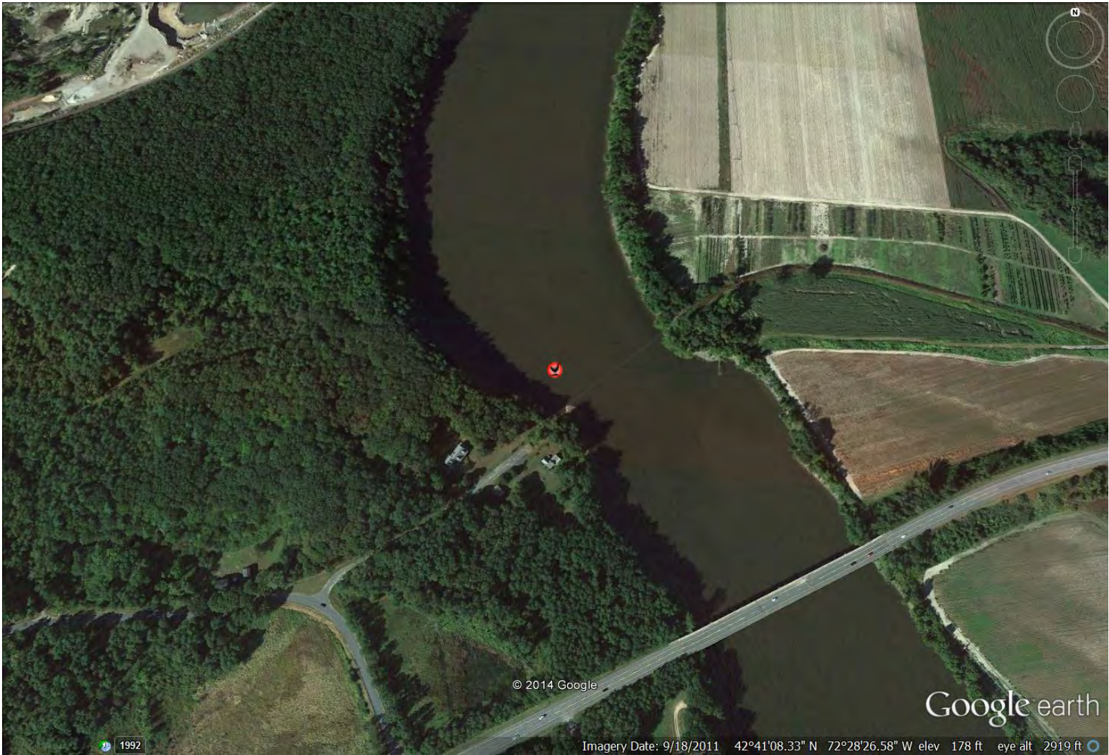
Photo 1114 Location

QA Observations: Upon review of the photos for this segment, classification made in the field was confirmed.