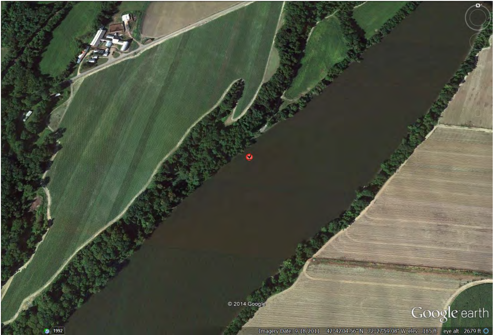
Photo 1155 Location

QA Observations: Upon review of the photos for this segment, classification made in the field was confirmed.