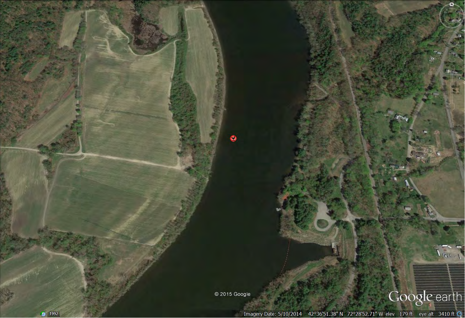
Photo 546 Location

QA Observations: Upon review of the photos for this segment, classification made in the field was confirmed and additional indicators of potential future erosion were included.