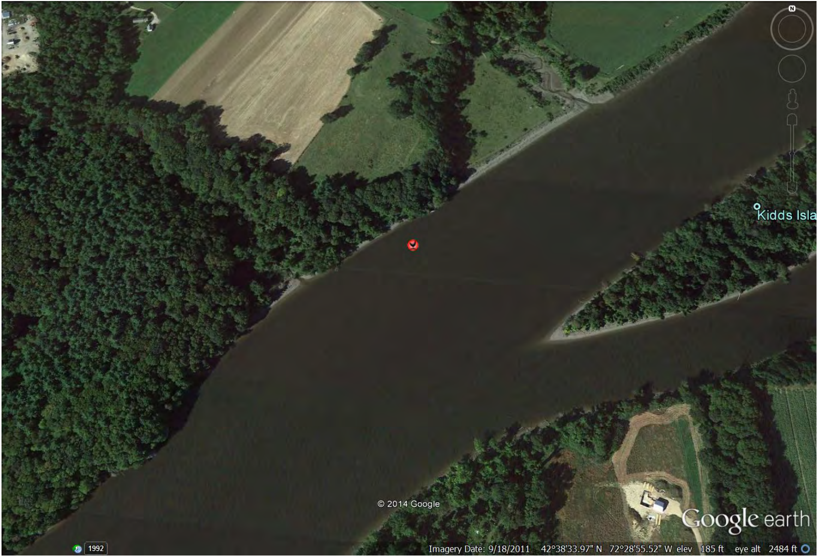
Photo 1004 Location

QA Observations: Upon review of the photos for this segment, classification made in the field was confirmed.