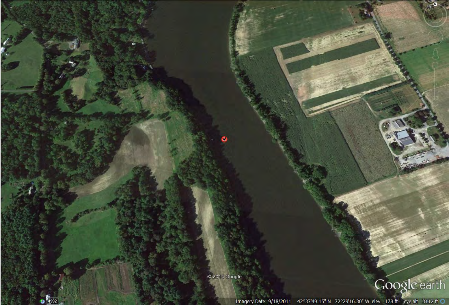
Photo 966 Location

QA Observations: Upon review of the photos for this segment, classification made in the field was confirmed and additional indicators of potential future erosion were included.